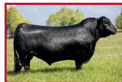
507AN769 EASY DECISION